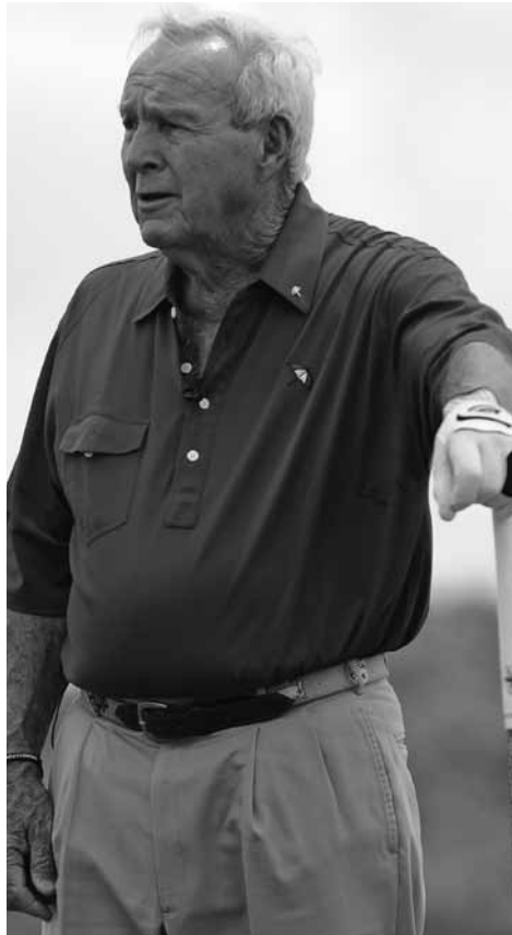
Arnold Palmer, (above), Jack Nicklaus and Gary Player played at The Big Three fund-raiser for the Mountain Mission Kids at the Olde Farm Golf Club on June 8, 2010 in Bristol, Virginia.

I had met and interviewed Arnold many times over the years and although I realized everybody thought of him this way, I considered him a friend. You, if you have ever met him, probably think the same way.