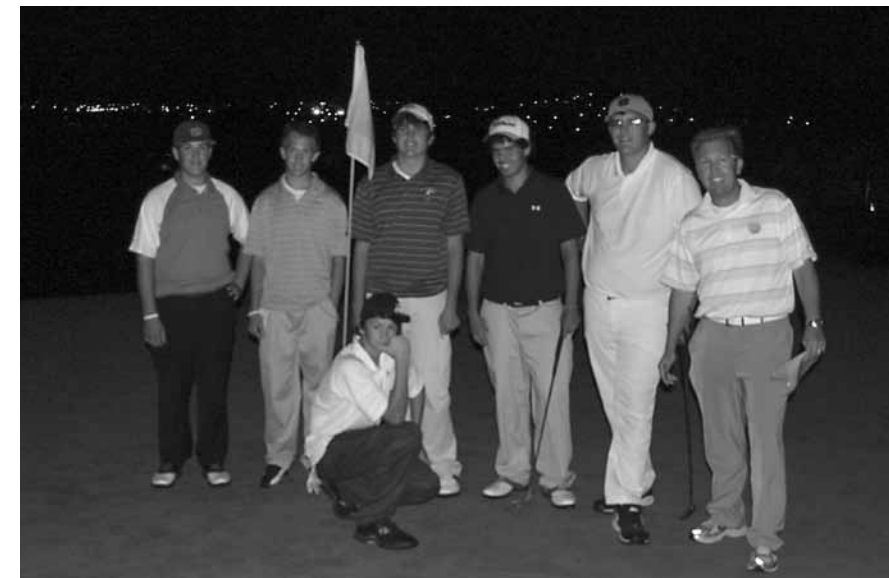
Although they were lining up their final shots by the light of a bright moon, aided by the St. George city lights in the background, this final group was able score five pars and a bogie on their final hole at Sunbrook Golf Club. The energized crowd gave them a standing ovation for their determination to finish the 4A Championship.