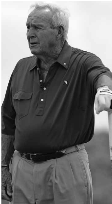
Arnold Palmer, (above), Jack Nicklaus and Gary Player played at The Big Three fund-raiser for the Mountain Mission Kids at the Olde Farm Golf Club on June 8, 2010 in Bristol, Virginia.

I had met and interviewed Arnold many times over the years and although I realized everybody thought of him this way, I considered him a friend. You, if you have ever met him, probably think the same way.