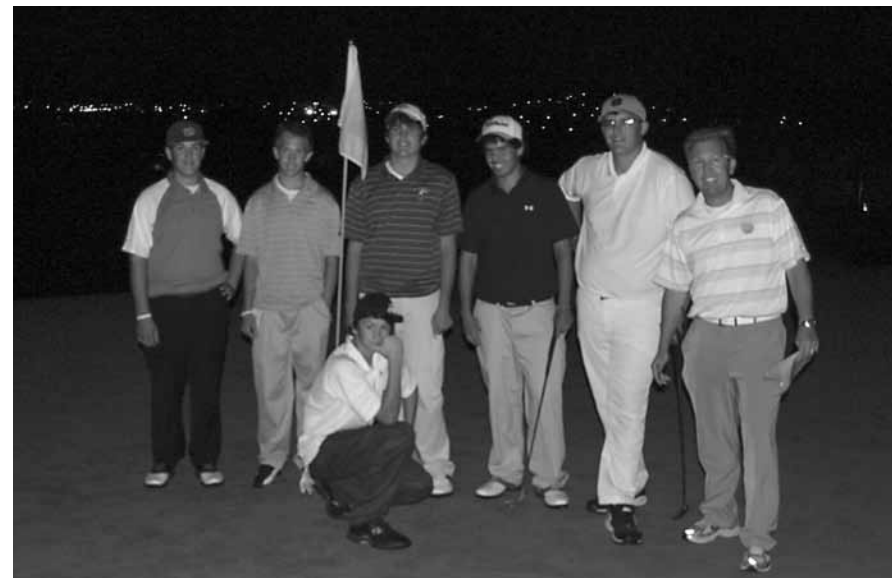
Although they were lining up their final shots by the light of a bright moon, aided by the St. George city lights in the background, this final group was able score five pars and a bogie on their final hole at Sunbrook Golf Club. The energized crowd gave them a standing ovation for their determination to finish the 4A Championship.